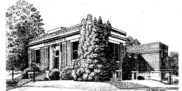
SOUTHBOROUGH LIBRARY SOUTHBOROUGH, MASSACHUSETTS

... volunteers help the library be a friend to all